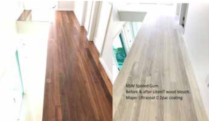
NSW Spotted Gum Before & after LiteniT wood bleach. Mapei Ultracoat 0.2pac coating

LiteniT wood bleaching system is great for furniture too. Anything in wood can be bleached including decking.